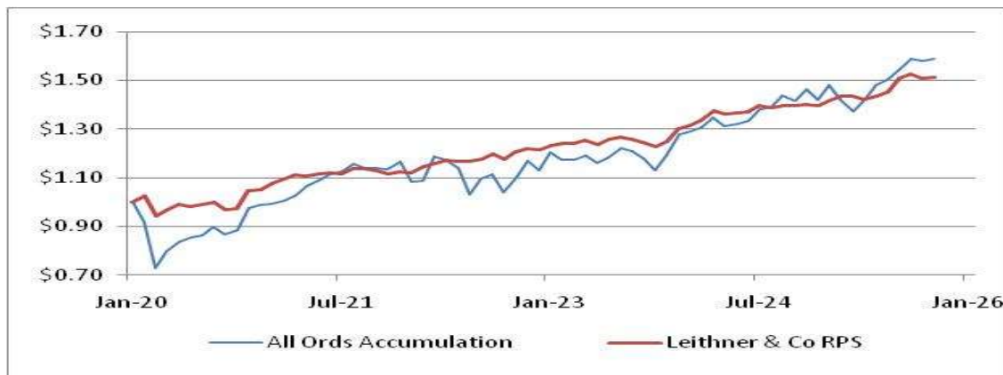
Figure 2: Growth of per $1 an Investment in Leithner & Co, January 2020-October 2025

Each $1 invested in LCO's RPSs in January 2020 generated proceeds of $0.51 by 31 October 2025. That's a compound annual growth rate (CAGR) of 7.6% per year versus the Index's proceeds of $0.59 and CAGR of 8.4% during this interval.