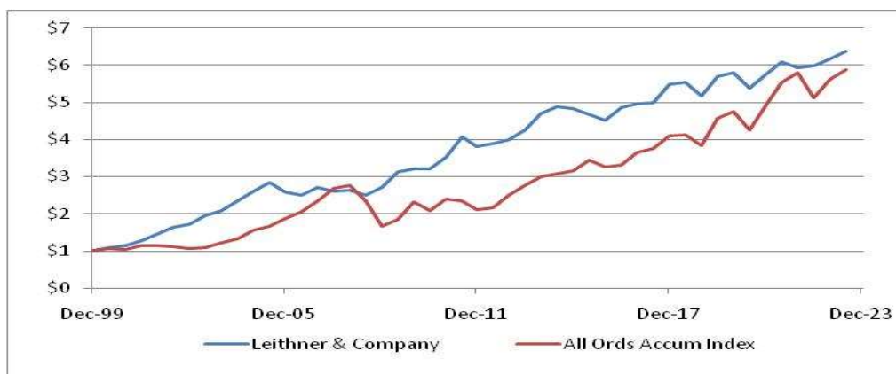
Figure 1: Growth of an Investment in Leithner & Co, June 1999-June 2023 1

Each dollar used to purchase Leithner & Co’s Redeemable Preference Shares on 30 June 1999, if the dividends received every six months had been reinvested to purchase more of